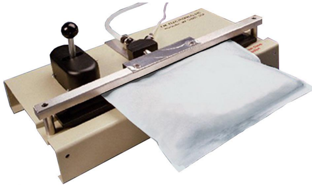
TS-01 12" Open Package Fixture