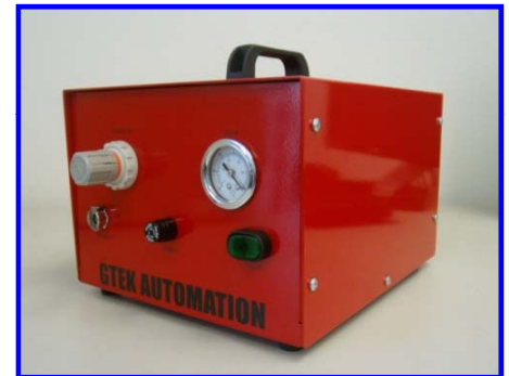
Vacuum Input Air Flow