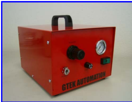
Pressure Output Air Flow